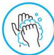
Hygiene and cleaning